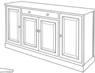
Hampton 66½ w x 36 t x 19 d