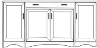
Hampton 65½ w x 36 t x 18 d