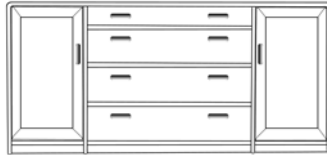
65½ w x 30¾ t x 18 d