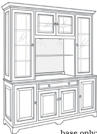
East Hampton Sideboard & Hutch