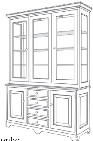
Charlotte's Classic Sideboard & Hutch

red oak or birch cherry or maple walnut, mahogany, or white oak stained dark