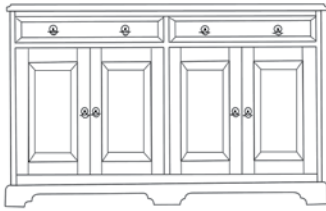
Classic Bradlee Sideboard