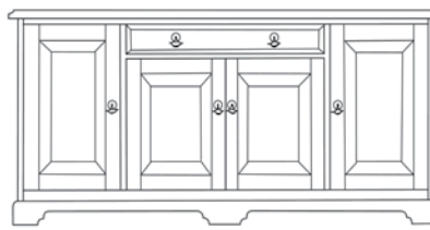
Classic Hampton Sideboard

$ 3,005 red oak or birch 3,165 ¼-sawn white oak, cherry or maple 3,480 walnut, mahogany, white oak stained dark