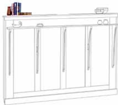
Craftsman Side Bed