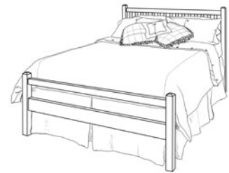
Craftsman—Version 2 Low footboard 25" 3% less