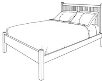
Craftsman—Version 1 Low footboard 20" 5% less