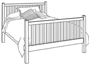
Craftsman—tall footboard Tall footboard 37½" same price

The Craftsman Beds , originally offered as platform beds, can be used with a box spring and mattress if the combination is no more than 20", without modifying the proportions of the bed. We sell Serta and TempurPedic mattresses and foundations. The tall footboard below is drawn with a 15" thick innerspring mattress; version 1 shows a 13" thick pillow-top; version 2 is drawn with a 9" mattress and 9" foundation.